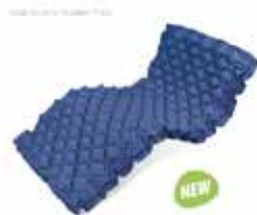
5.6" Bubble Mattress

possibility of adjust comfort range. The pump can be hung to 140" HQ: sets (Bubble Pad & Pump)