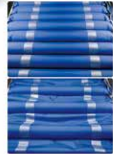
Two tubes alternating

M6-60I Alternating Pressure Mattress is made up by 20 pcs of 9.5cm / 4" cells. The Alternating System includes A/B groups to keep inflating and deflating alternatively in cycles which forming the wave imitation. The alternating function of interchangeable cells with pumps can reduce the pressure part between the patient's body and mattress in order to prevent and relief the pressure ulcers.