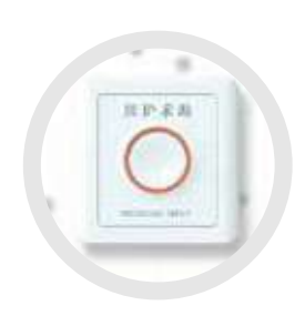
Toilet room extension