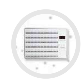
List of patient