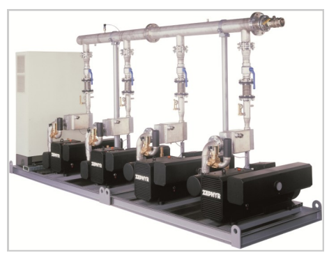
Medical Vacuum System, ULTRAVAC 4.500/2000-CLP with dry rotary claw vacuum pumps, without oil (no maintenaince required!)