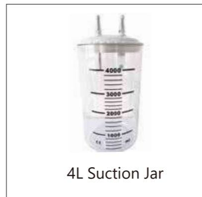
4L Suction Jar