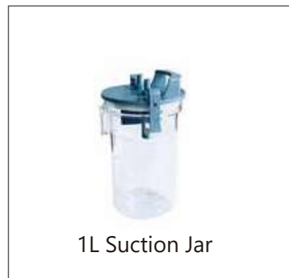
1L Suction Jar