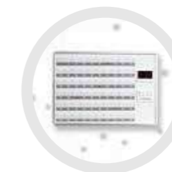
List of patient