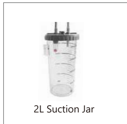
2L Suction Jar