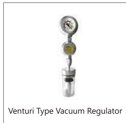
Venturi Type Vacuum Regulator