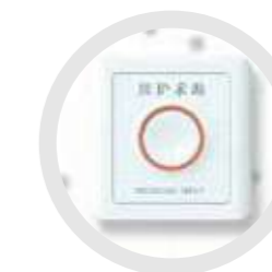
Toilet room extension