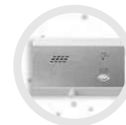
Nurse call extension