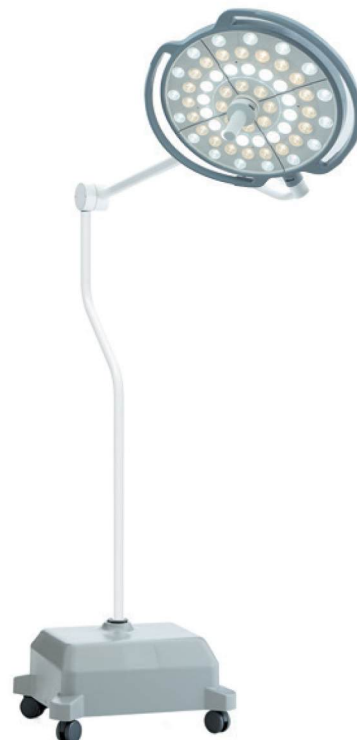
Model: LD05.06 Mobile with Battery Battery back up system provides 2,5 hours of energy