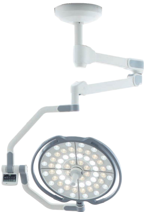
Model: LD10.01 Single Head Operating Lights