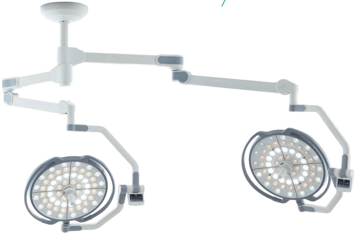
Model: LD10.02 Double Head Operating Lights