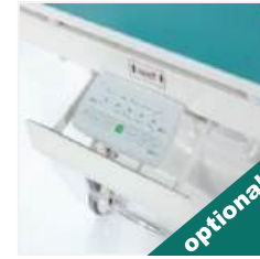
Nurse Panel Shelf