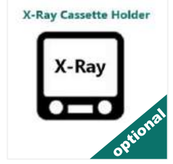
X-Ray Cassette Holder at Backrest