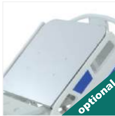
X-Ray Translucent HPL Backrest