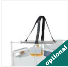
Monitor & Defibrillator Shelf