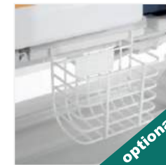
Urine Bag Basket