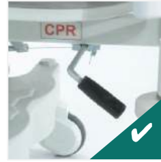
Dual Sided Manual CPR at Backrest