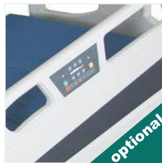
Control Panels Embedded on Side Rails