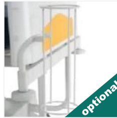
Oxygen Cylinder Holder