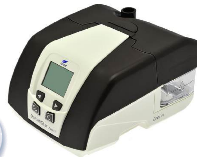
DreamStar™ DuoST Evolve w/ water reservoir

For more information contact us at the following addresses : customerservice@sefam-medical.com marketing@sefam-medical.com